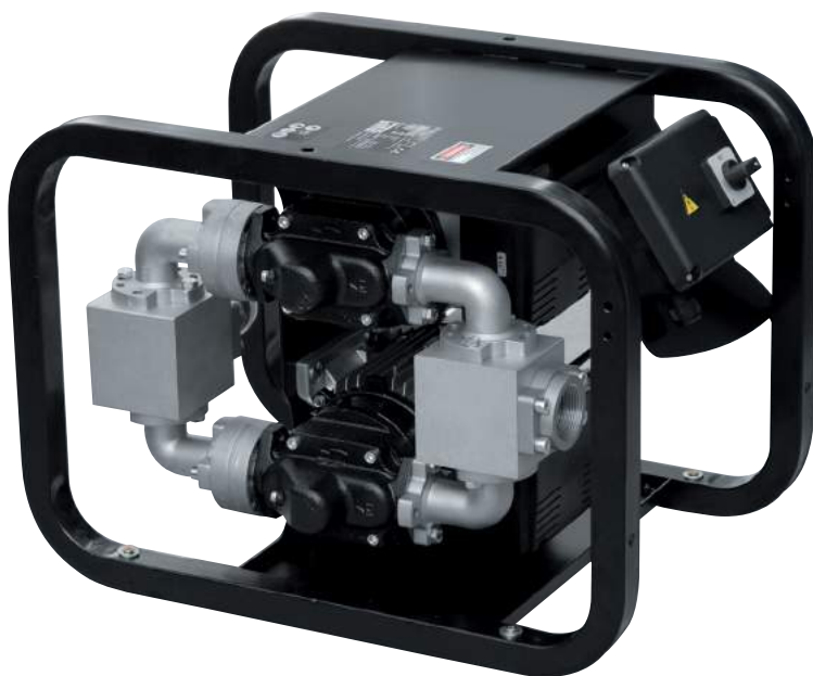
ST 200 AC