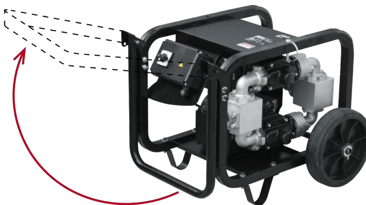
HANDY KIT: VERSION WITH WHEELS AND HANDLE